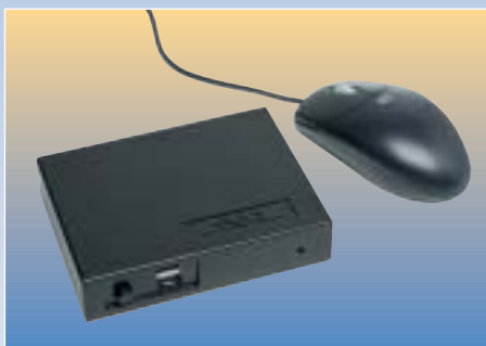
AX3000 Model 70W