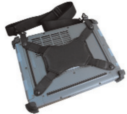
Hand and shoulder strap